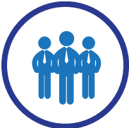
creativity and innovation